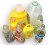
Plastic Bottles #1 & #2